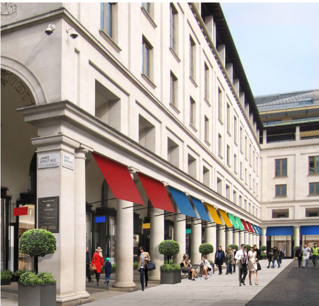
Option 3: Awnings in a variety of colours relating to the individual tenant's branding