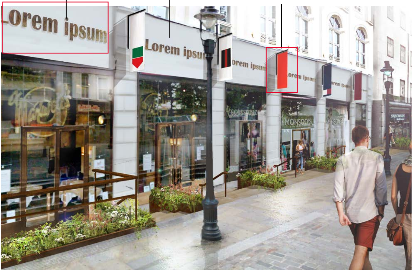
Illustrative view of the proposed Royal Opera House facade

Signage proposed to the columns between retail units