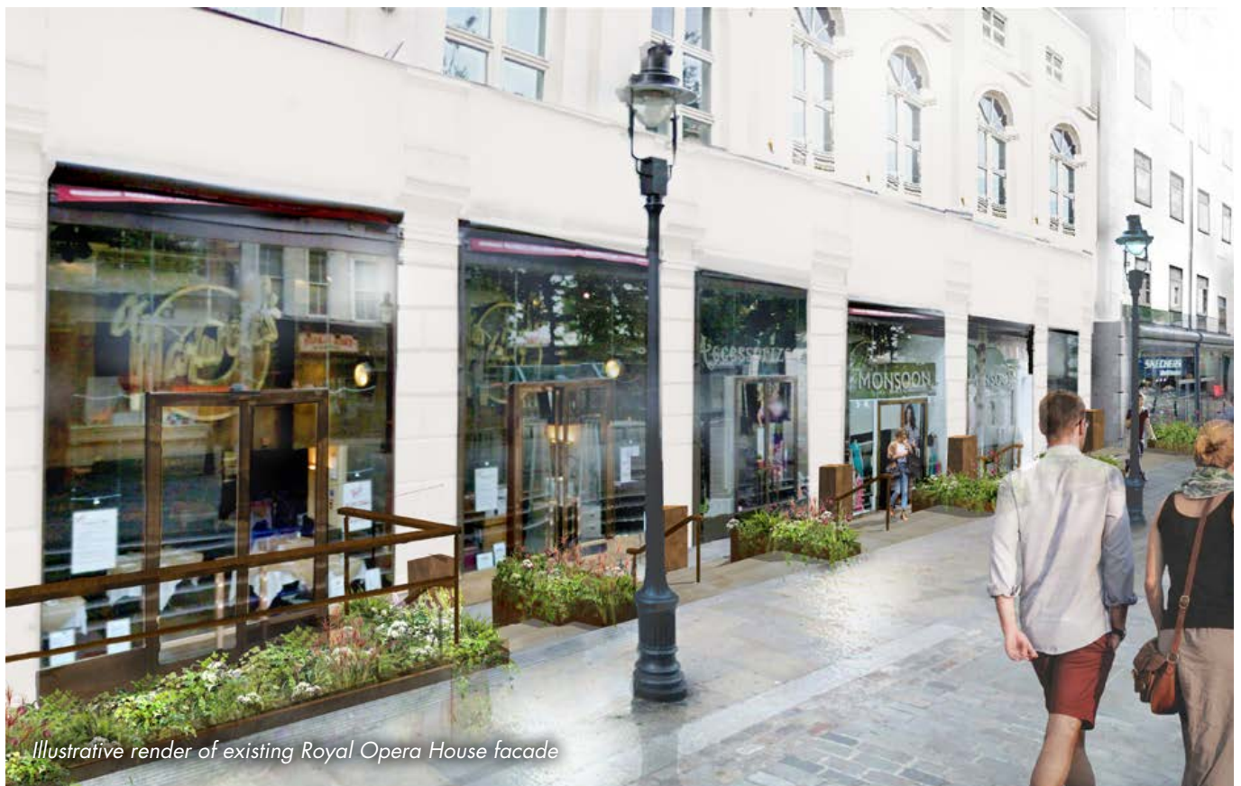
Illustrative render of existing Royal Opera House facade

Enhance wayfinding and connectivity within the Estate through consistent signage