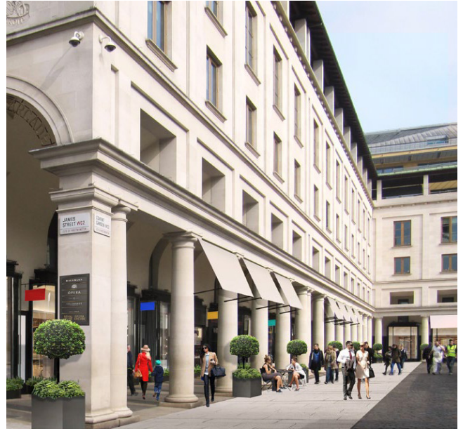
Option 2: Awnings located at particular openings which could reflect the tenant (i.e. café or restaurant use)