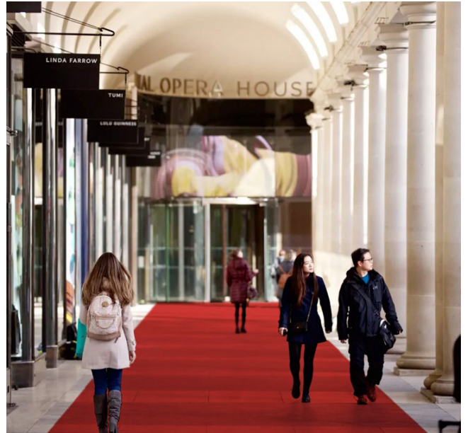
The red carpet improves the destinational retail character and Royal Opera House Piazza entrance