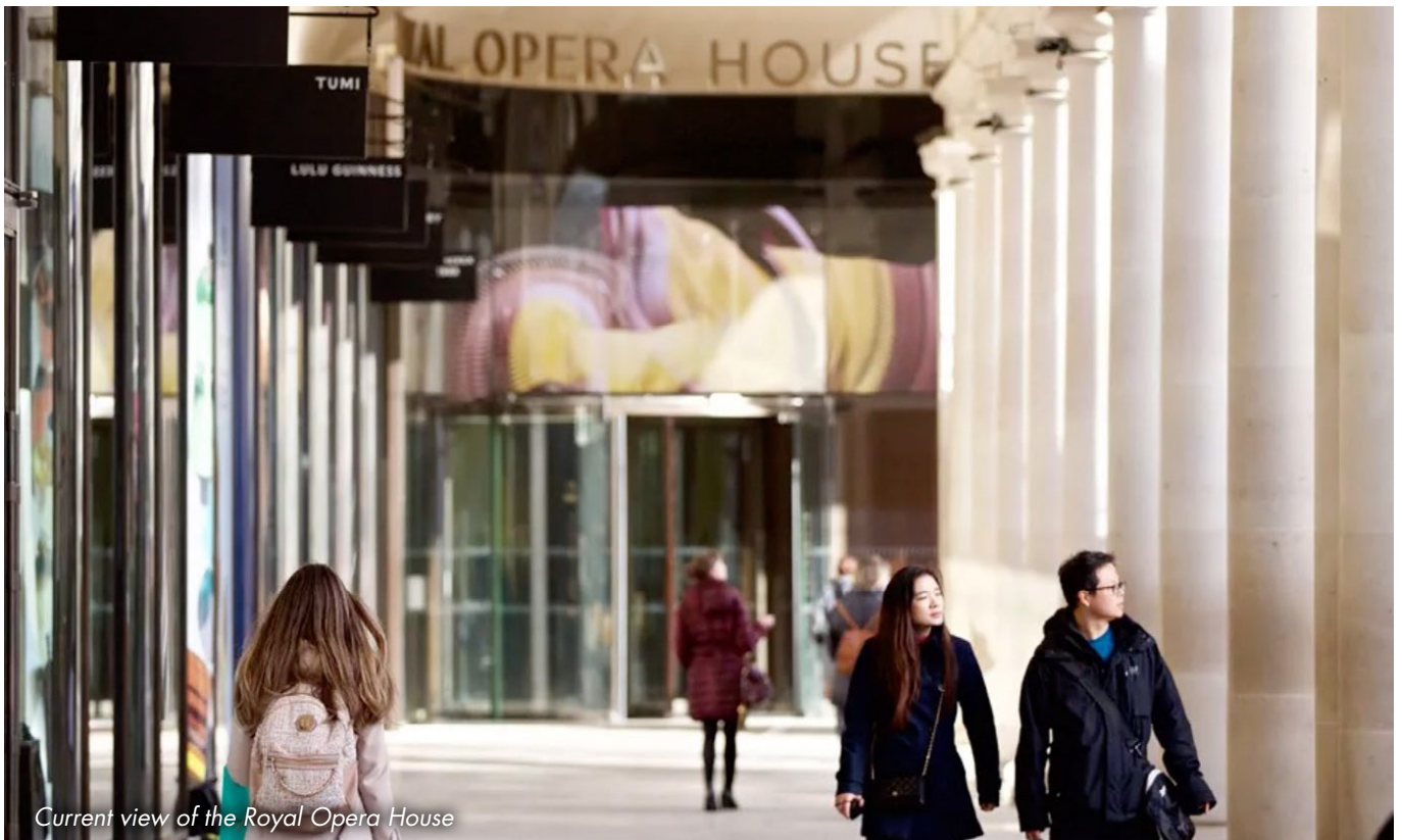
Current view of the Royal Opera House

Post-pandemic, support is required to let a number of vacant units