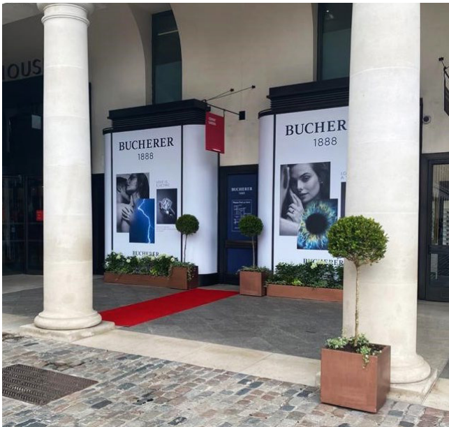
Option 2: Individual red carpets perpendicular to the colonnade