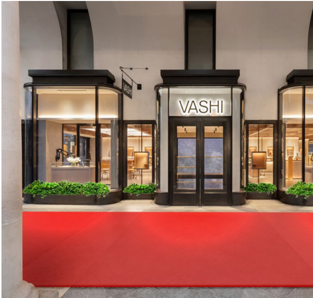
Option 1: A singular red carpet lines the colonnade providing a bold introduction of colour