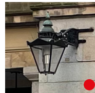
Existing heritage lanterns currently installed on site