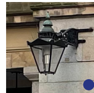
Additional heritage lanterns to replicate those existing to improve artificial light levels at street level