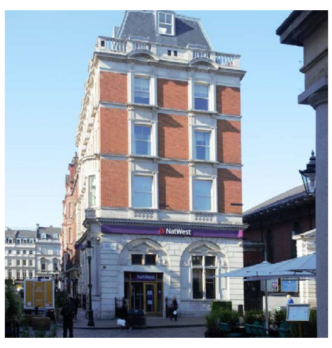
Photograph of Covent Garden Frontage - As Existing