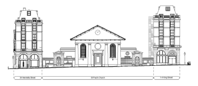
Proposed Piazza elevation (on the left) framing St Paul's Church with 1 – 4 King Street to the right