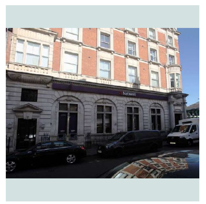
Photograph of Henrietta Street Frontage - As Existing