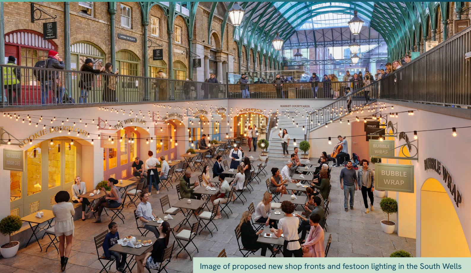
Image of proposed new shop fronts and festoon lighting in the South Wells