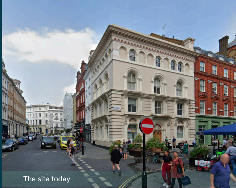
The site today

The plans will deliver high quality fitted office accommodation, accessed via a designated reception area on Henrietta Street plus end of trip facilities, and a new restaurant or retail unit over ground floor and basement fronting onto Bedford Street.