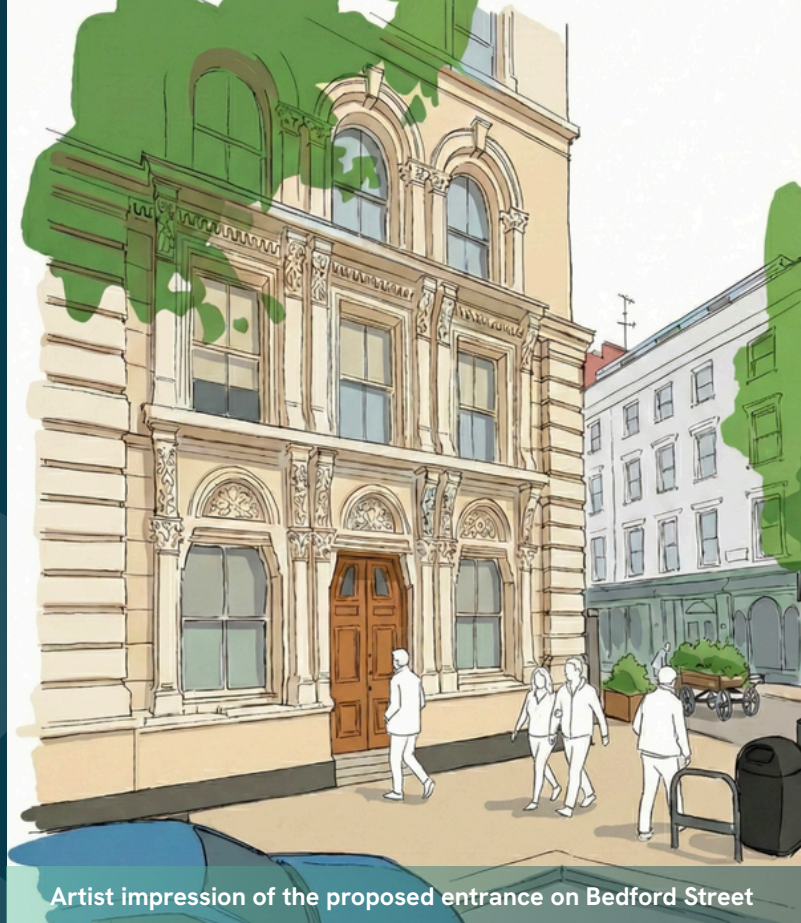
Artist impression of the proposed entrance on Bedford Street

The intention is to restore, repair, and upgrade the existing building fabric, addressing areas of disrepair, improving its internal spaces, and ensuring the building secures its optimum viable use.